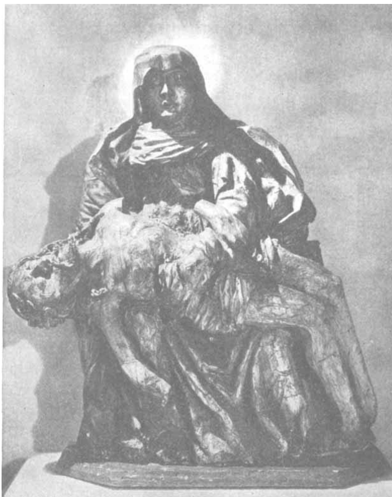
Fig. 2.—Large wood carving, Mary with Jesus.

With such a background, and the fervent piety of the plain people naturally reflected in the learned professions, of which pharmacy was one, it is not surprising to find the