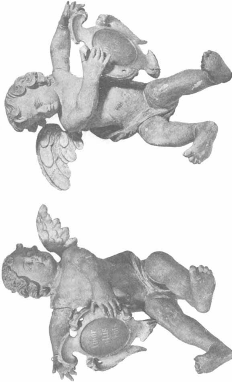
Fig. 6.—Pair of cherubs representing a portion of the decorative elements of the Pharmacy.

tant series; typical of the latter are quotations from Christ's sayings taken from Luther's translation of the Bible, as is the case in this painting. On the other hand, the Host shown above the chalice is frequently a Catholic symbol.