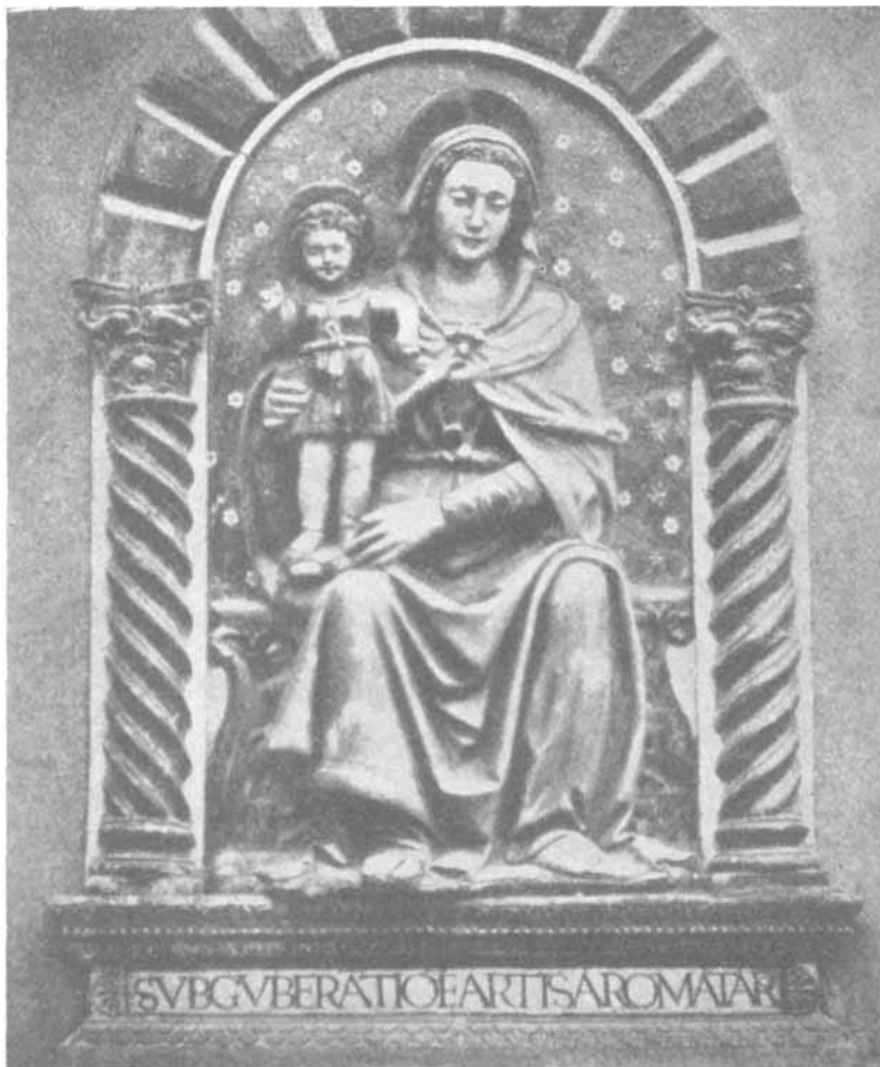
Fig. 1.—Della Robbia bas-relief, Santa Barnaba Church.

Long after the healing or care of body and soul had become separate professions, tradition of the old combination still shed its glory over pharmacy. The Christian Church considered the supply of remedies to