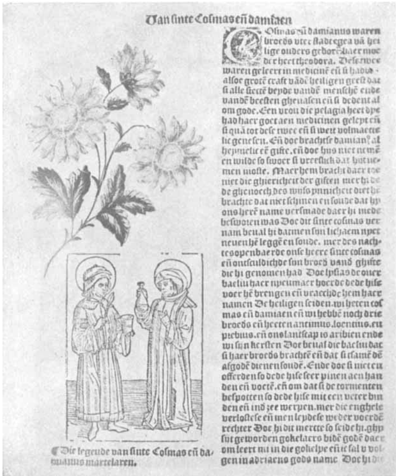
Fig. 3.—Cosmas and Damien—page from Dutch Legend Book.

In Central Europe, where the custom of naming the pharmacies after persons, animals, planets, etc., has continued to the present, many a pharmacy, especially in Catholic Bavaria, bears the name "Marien-apotheke" (Virgin Mary Pharmacy) and