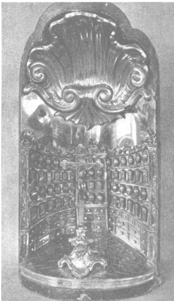
Fig. 5.—Gold and Silver Votive Shrine in form of a Pharmacy.

penses justice. The chalice bears the word "Glaube" (faith). The herb on the right side symbolizes with its designation "Tag und Nacht" the omnipresence of God; the herb in the foreground with its appellation "Kreutzwurtzl" (cross-root) suggests the crucifixion. The drug containers on the table carry inscriptions representing the more important Christian virtues, among them charity, constancy and hope. Quotations of Christ's word appearing to both sides